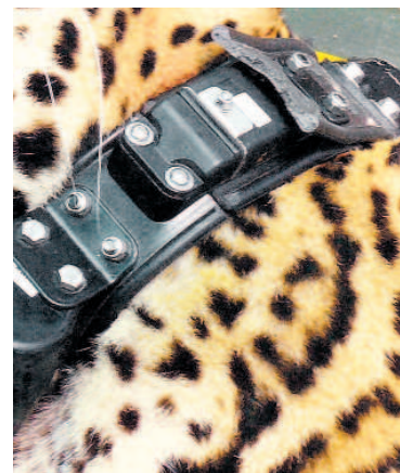
Radio collar fitted on the leopard

We lost Ajoba after 633 readings. It could be due to a malfunction in the collar, or it may have been damaged during his movements through water bodies